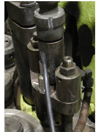
Vibro-acoustic sensor magnetically mounted on injector valve

The experience in the performance analysis of marine engines shows, that the analysis of vibration diagrams, that have been recorded parallel to the indicator diagrams, delivers advanced diagnostic information.